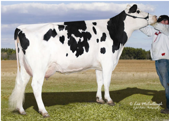
GLO-CREST O MAN PIRATE 4092 FIFTH DAM