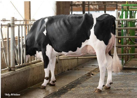
PROGENESIS EINSTEIN EVEN P DAM