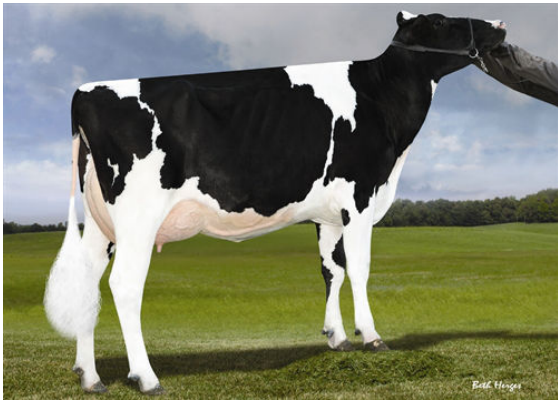
LADYS-MANOR S DAHLIA FIFTH DAM