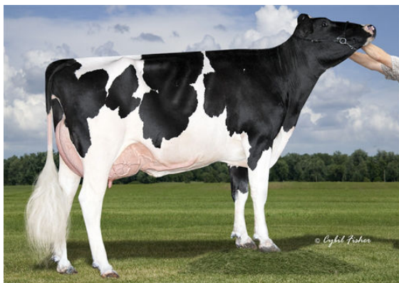
AOT SALVATORE HICCUP GRANDDAM