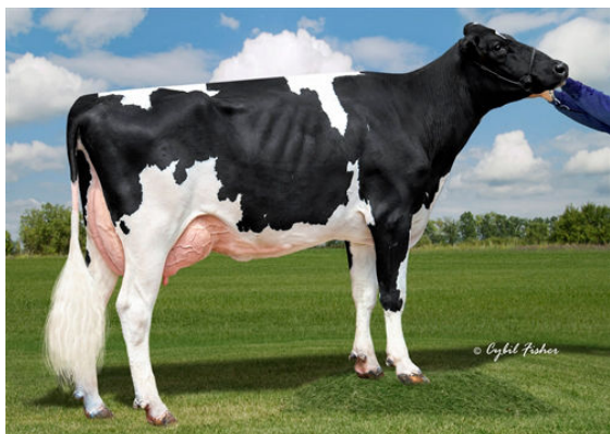
AOT MARK HIGHSTRUNG DAM