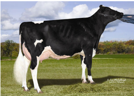
COOKIECUTTER MOM HALO FIFTH DAM