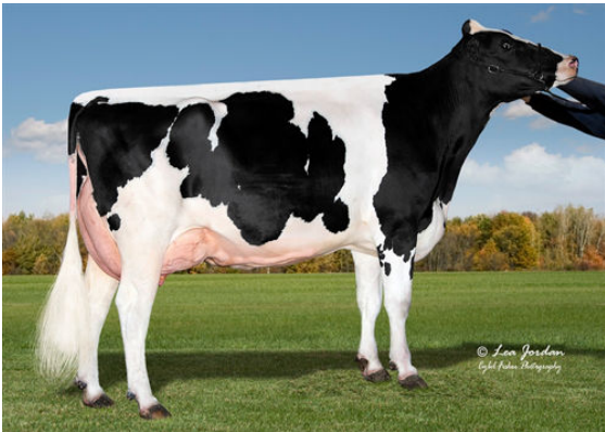
COOKIECUTTER HOPELYNN GRANDDAM