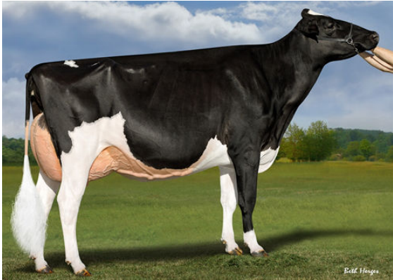
S-S-I DOC HAVE NOT 8784 FULL SISTER TO DAM - SOLD WITH PACKAGE OF PREGNANCIES FOR $1.9M IN JUNE 2022