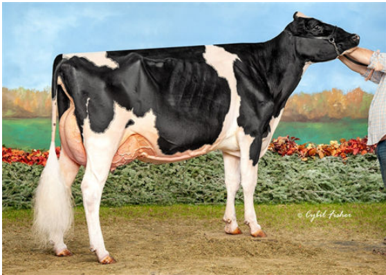
S-S-I DOC HAVE NOT 8783 DAM - NOMINATED ALL-AMERICAN MILKING YEARLING 2019