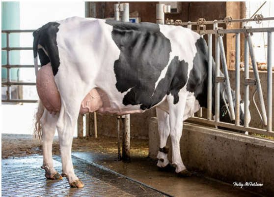
PROGENESIS EINSTEIN RUDY DAM