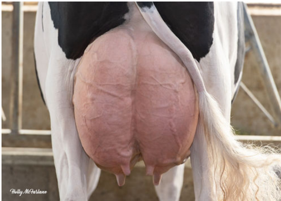
PROGENESIS EINSTEIN RUDY DAM