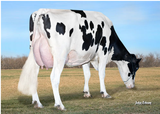
S-S-I BOOKEM MODESTO 7269 FIFTH DAM