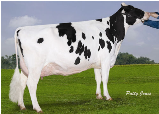
BOSDALE OUTSIDE PORTRAIT FOURTH DAM