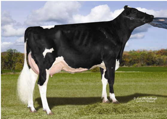
COOKIECUTTER MOM HALO FIFTH DAM