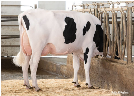
PROGENESIS RIVETING ECCENTRIC DAM