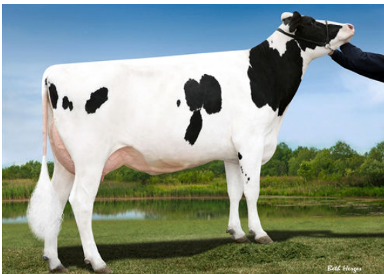
SWAMPY-HOLLOW HOPE FOURTH DAM