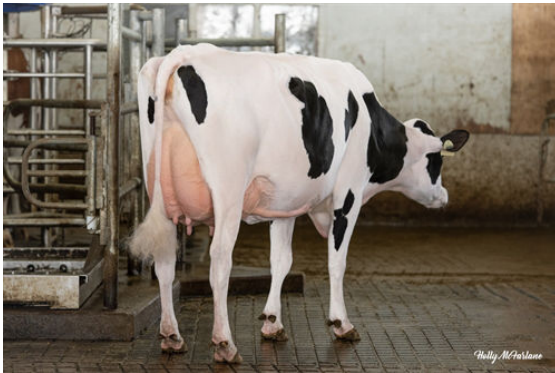
PROGENESIS RIVETING ECCENTRIC DAM