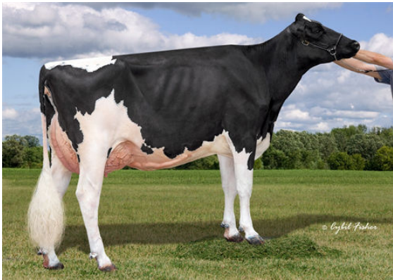
KINGS-RANSOM CASP DAZE DAM