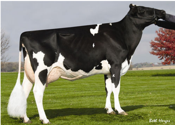
AMMON-PEACHEY SHAUNA FIFTH DAM