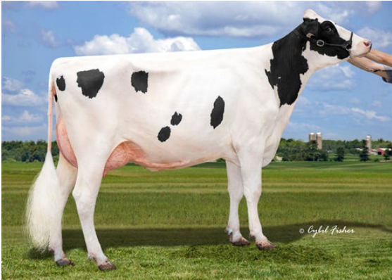
MIDAS-TOUCH DOC JAY DAM