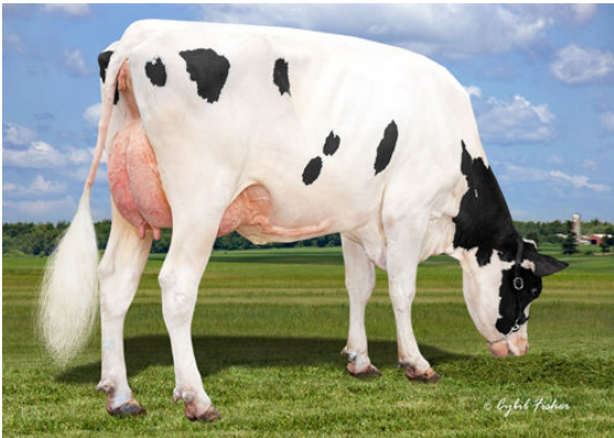
MIDAS-TOUCH DOC JAY DAM