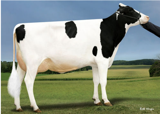
SANDY-VALLEY MD PLEASURE THIRD DAM