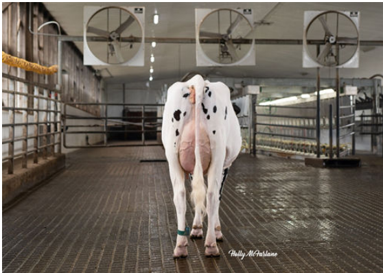
STANTONS TOPNOTCH TALENT GRANDDAM