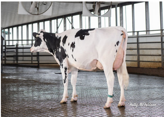
STANTONS TOPNOTCH TALENT GRANDDAM