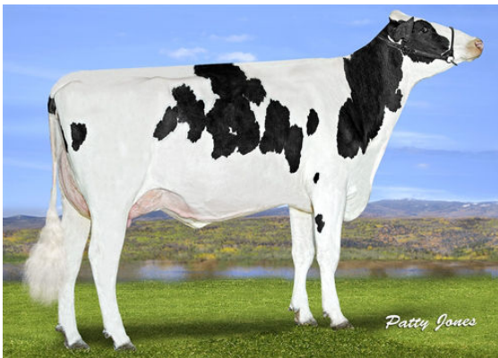
PROGENESIS MONTANA BEAUVAIS THIRD DAM