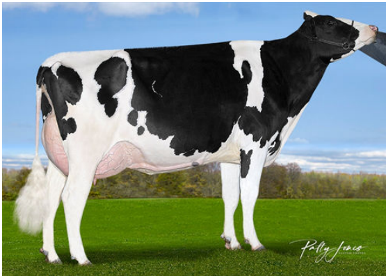
VOGUE PADAWAN ELUSIVE-P DAM