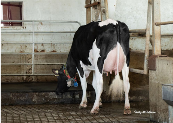
PROGENESIS GUARANT MILLIONS GRANDDAM