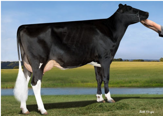
IHG WINNEY JEROD 55380 FOURTH DAM