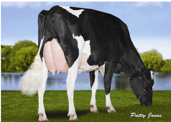
RANSOM-RAIL FACEBK PARIS