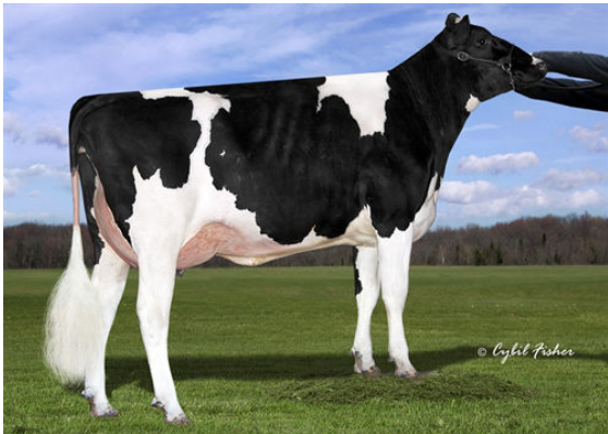
SIEMERS DENVER PARIS