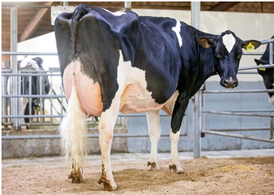
SIEMERS LMDA PARIS 27856