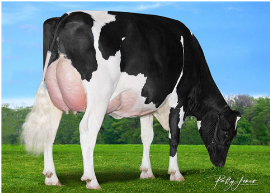
CLAYNOOK ZIVA HOUSE DAM