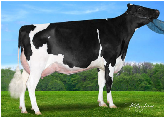
CLAYNOOK ZIVA HOUSE DAM