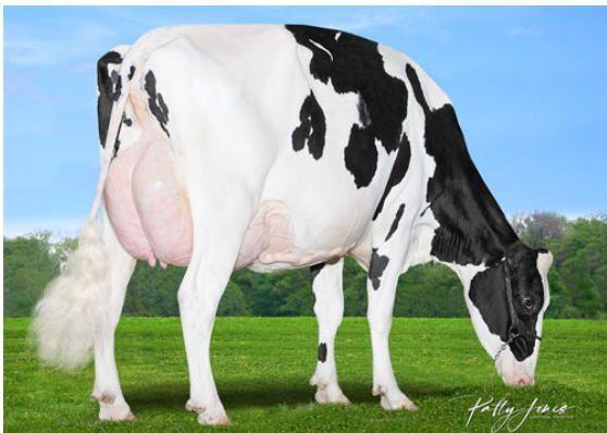
MORNINGVIEW DUKE ZIP GRANDDAM