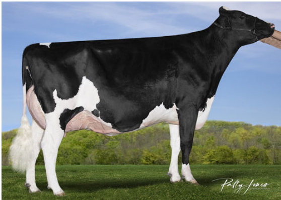
SILVERRIDGE V DUKE EMAIL GRANDDAM