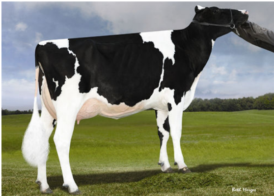
LADYS-MANOR S DAHLIA FOURTH DAM