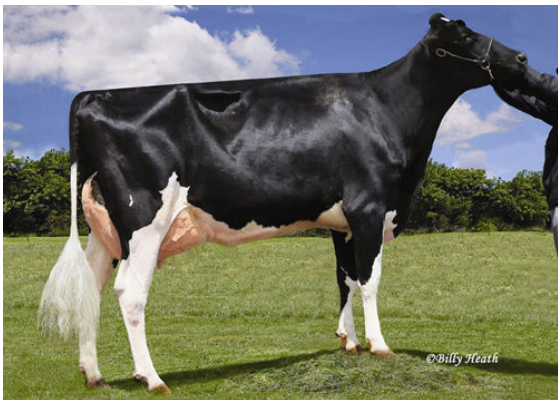
LADYS-MANOR ALLANAS DORA FIFTH DAM