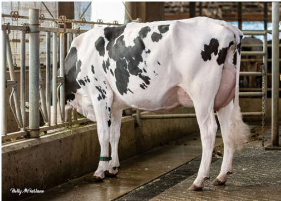
PROGENESIS MONTEVERDI LOOSE DAUGHTER