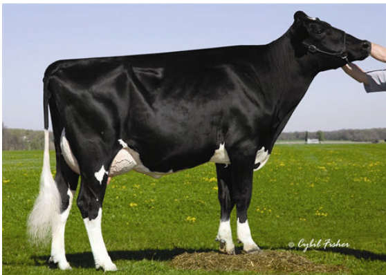
REGANCREST BRYNNA FOURTH DAM