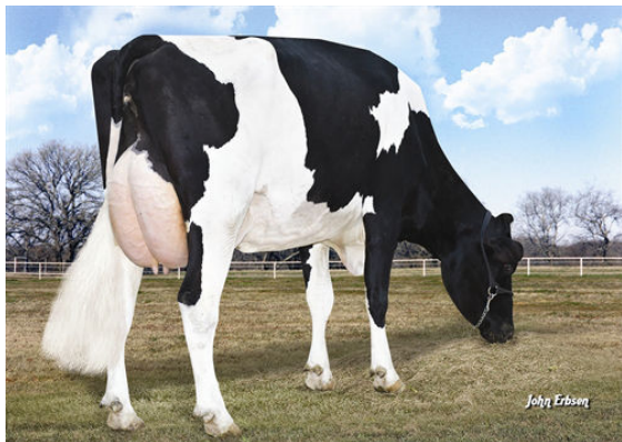
MORNINGVIEW SUPER ROXY