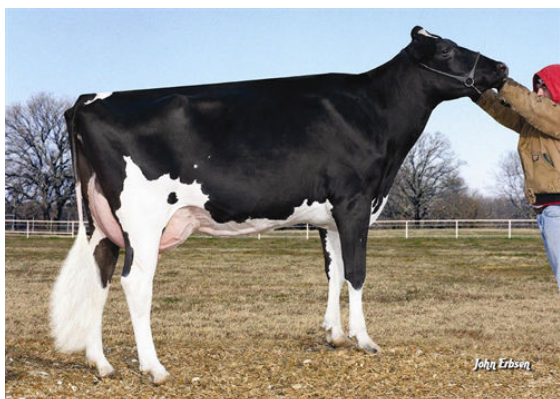
MORNINGVIEW PRONTO C-RAE