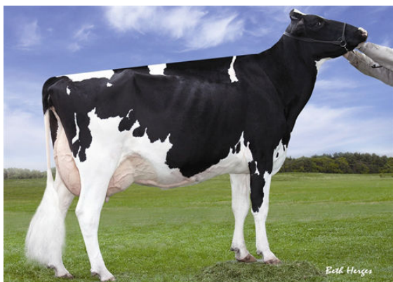
REGANCREST CHASSITY TY TL FIFTH DAM