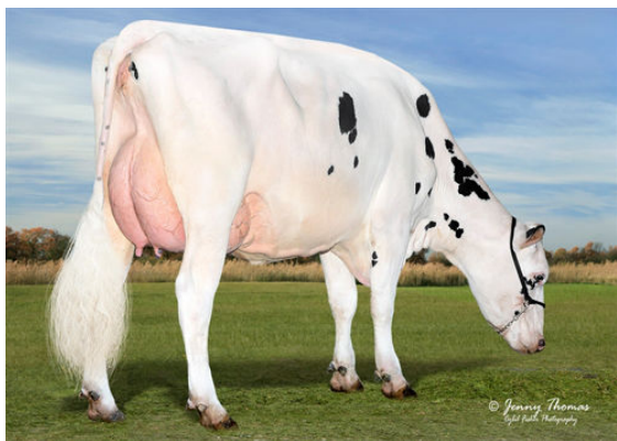
OCD RUBICON CAITLYN 4553 GRANDDAM