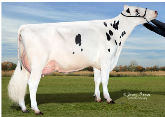
OCD RUBICON CAITLYN 4553 GRANDDAM