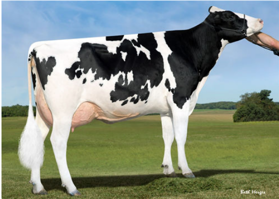
SANDY-VALLEY MORGAN ERA GRANDDAM