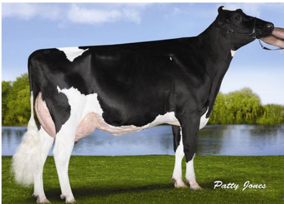
RANSOM-RAIL FACEBK PARIS FOURTH DAM