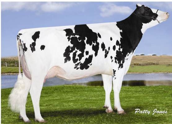
RUSSELLWAY CAMERON PINKY FIFTH DAM