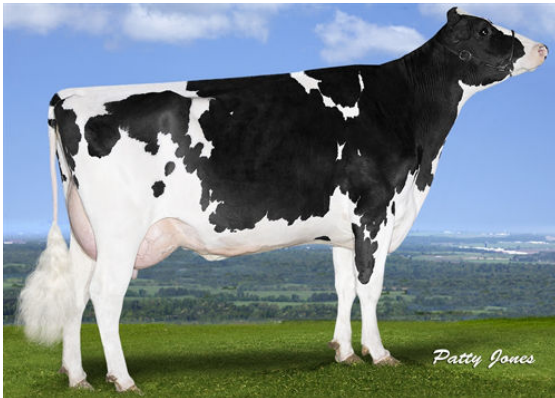
PROGENESIS ENFORCER PAT FOURTH DAM