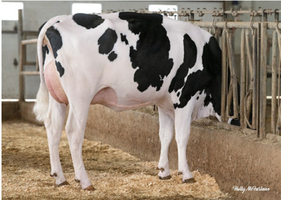
PROGENESIS LUGNUT NEW MOON DAUGHTER