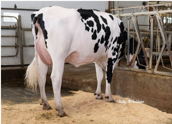
PROGENESIS MARIUS MARKS DAM