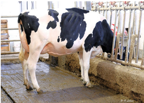
LEHOUX STARS FUNKY DAUGHTER