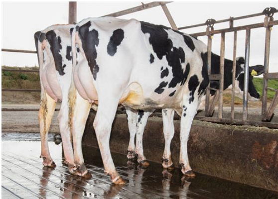
BOSA DAUGHTER GROUP DAUGHTER