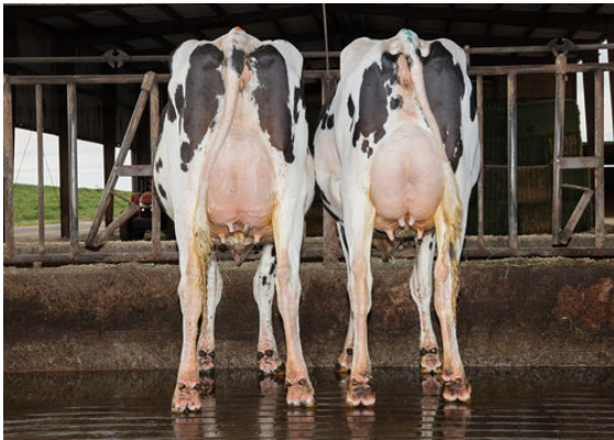
BOSA DAUGHTER GROUP DAUGHTER