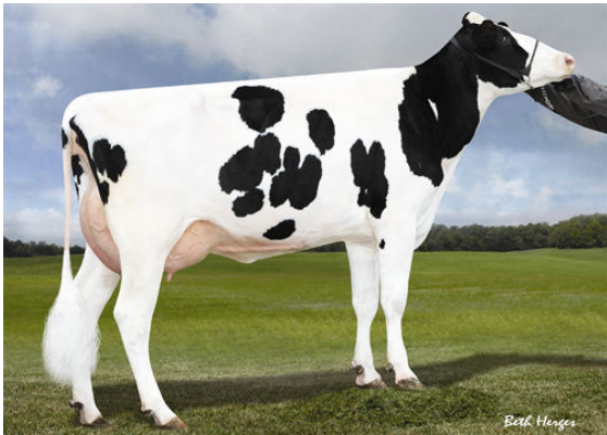
MISS OCD ROBST DELICIOUS FOURTH DAM