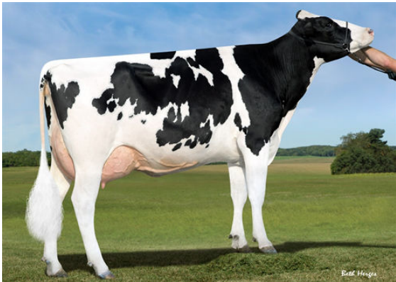
SANDY-VALLEY MORGAN ERA THIRD DAM