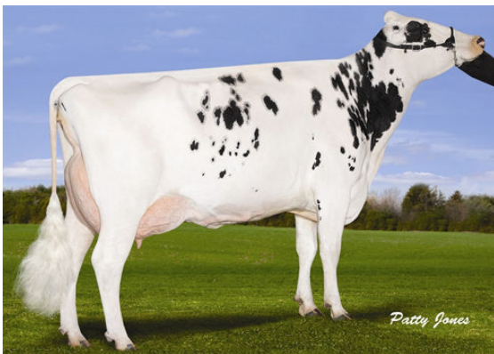
GEN-I-BEQ SHOTTLE BOMBI