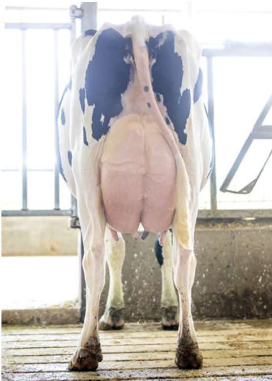
SIEMERS TRJ BROOKE 28030