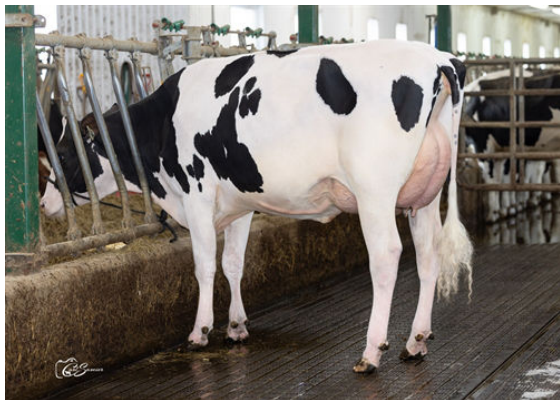
ANTIA SPEEDUP MILOUNY DAUGHTER