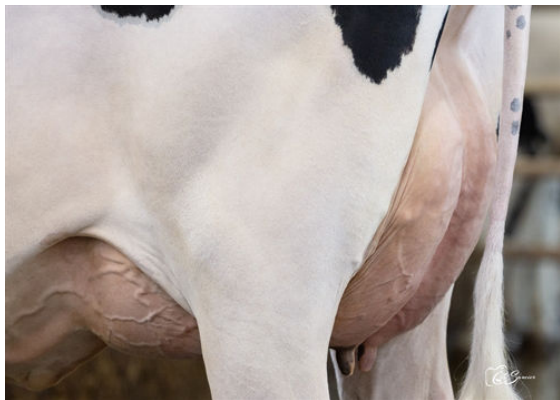
ANTIA SPEEDUP MILOUNY DAUGHTER