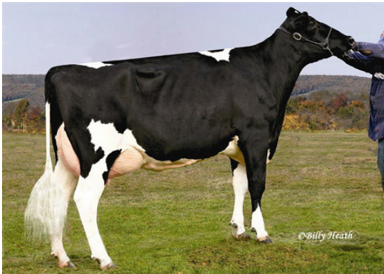
COOKIECUTTER GLD HOLLER FOURTH DAM