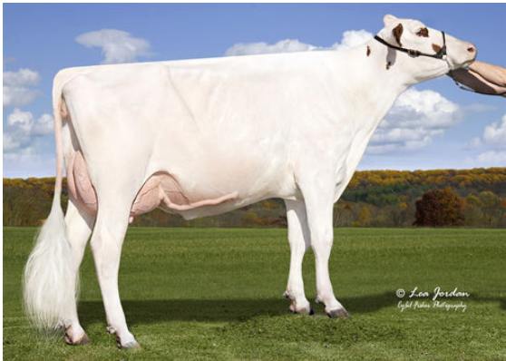
MIDAS-TOUCH AIRAINE-RED DAM