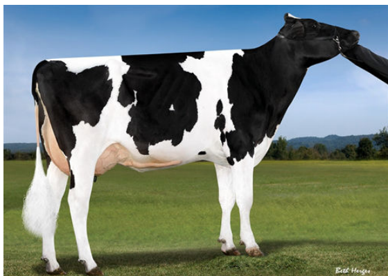
BOMAZ SILVER 6777 GRANDDAM