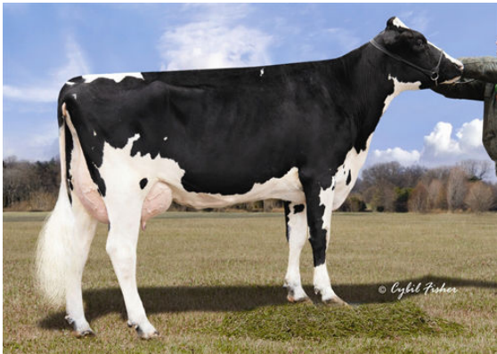
CLEAR-ECHO M-O-M 2213 FIFTH DAM