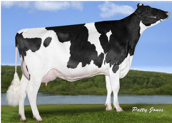
CLEAR-ECHO MCUTCHEN 2820 FOURTH DAM