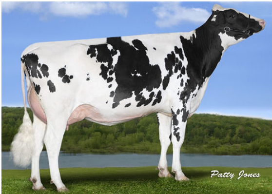
GILLETTE JEDI CLEAVAGE GRANDDAM