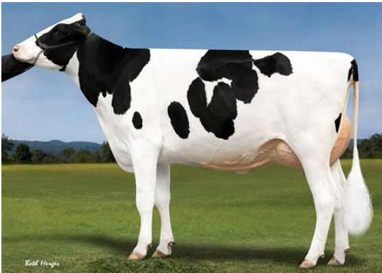
PROGENESIS DUKE MOLDAVITE GRANDDAM