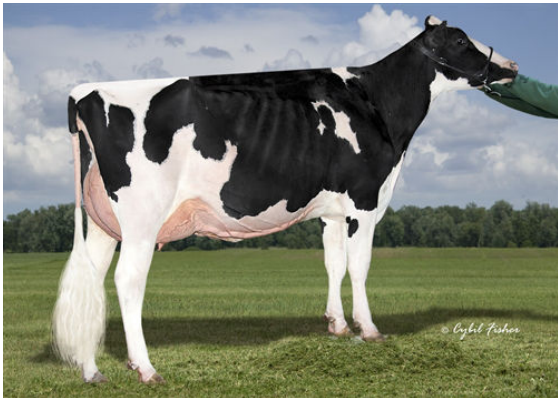
SIEMERS LBA HANINA 28047 DAM