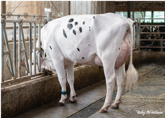
WESTCOAST MNHTTN ABYSS 11917 DAUGHTER