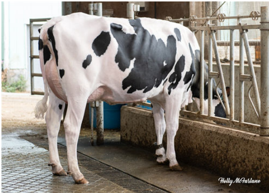
PROGENESIS MANHATTAN PIPER DAUGHTER