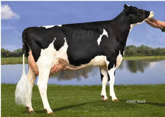
KY-BLUE GW DANA FIFTH DAM