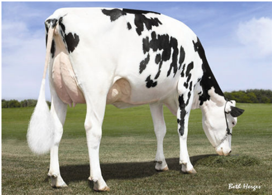
MS C-HAVEN OMAN KOOL FIFTH DAM