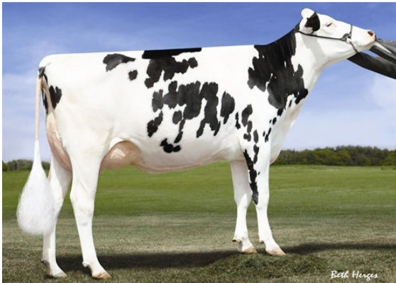
MS C-HAVEN OMAN KOOL FIFTH DAM