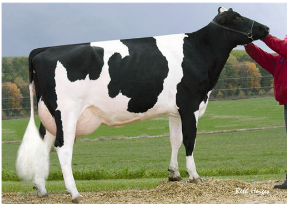
SANDY-VALLEY BOLT SHEILA FIFTH DAM