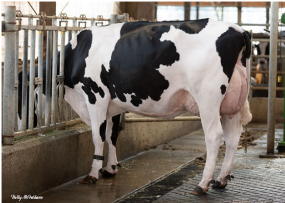
WESTCOAST MNTBLNC FR8167 11529 DAUGHTER