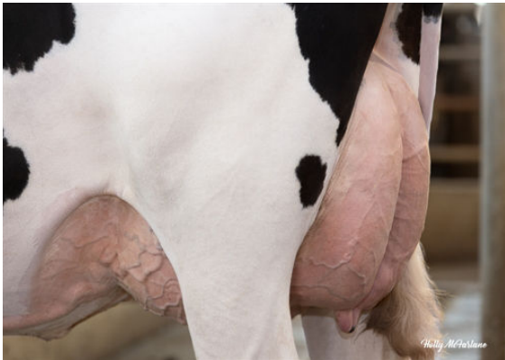
WESTCOAST MNTBLNC FR8167 11529 DAUGHTER