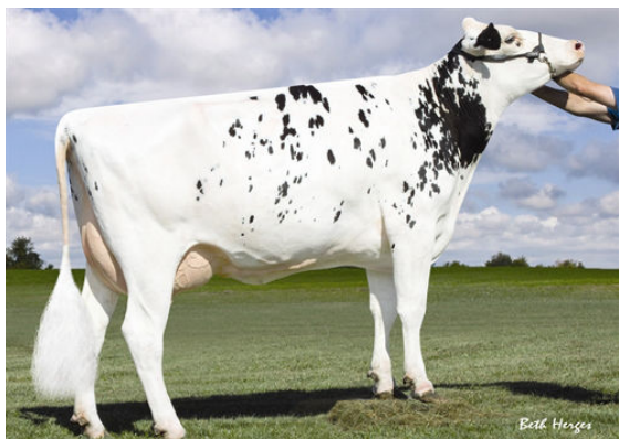
BKB SHOTTLE ARIN FIFTH DAM